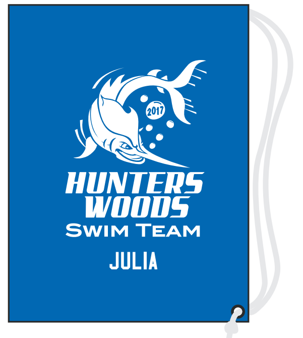
Imprint Size 9" Tall