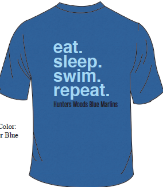
Back Actual Size 10.5" Wide