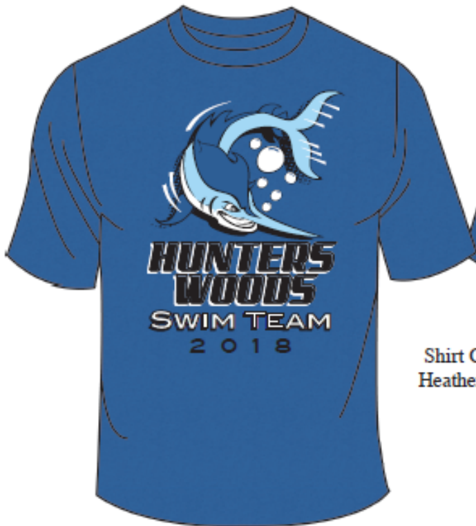
Front Actual Size 10.5" Wide